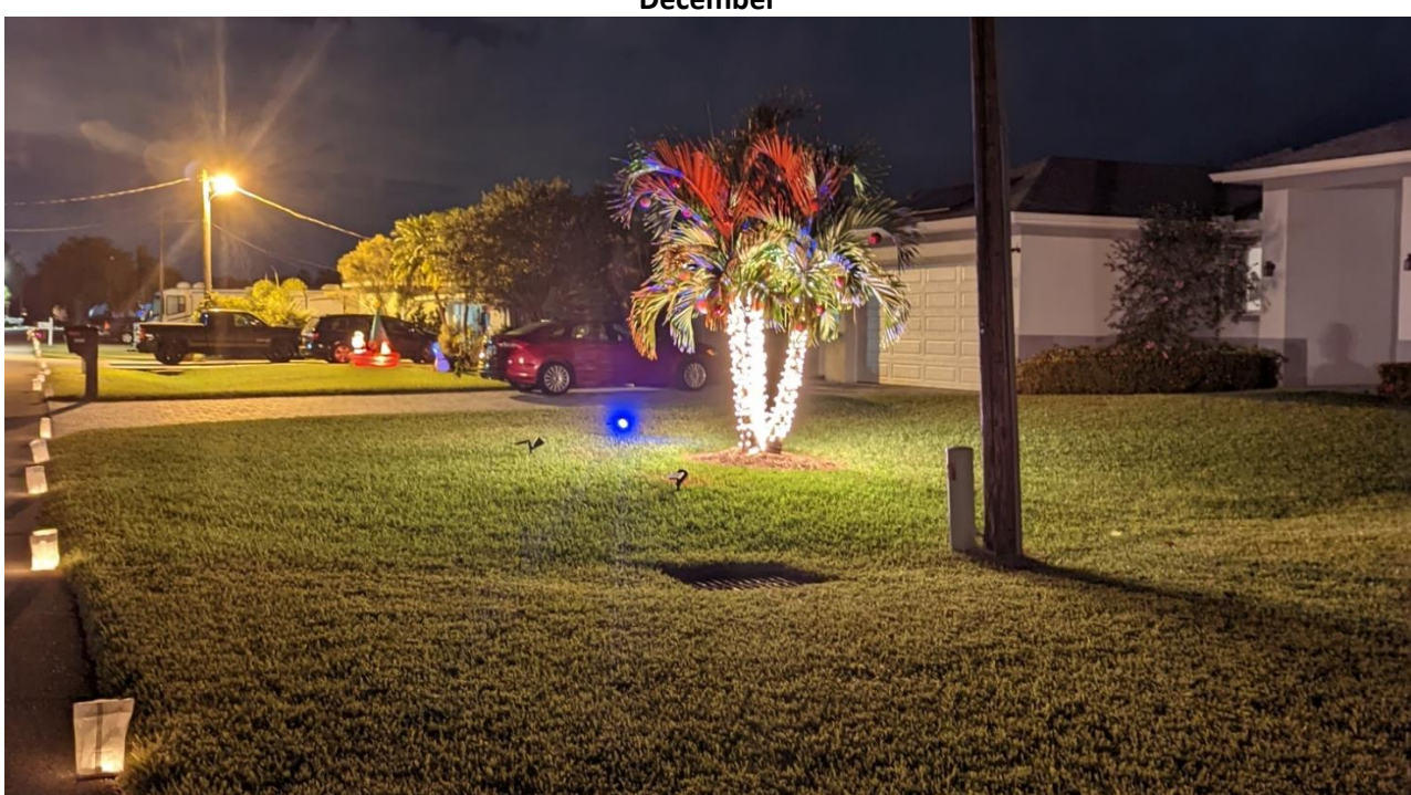
Wishing everyone a blessed holiday season and happiness through 2022!! Stay healthy, remember that God loves others as much as you and that our judgment doesn't count, and stay in touch. We're not using social media but our emails and phones work just fine!