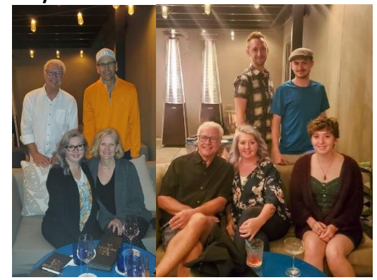
April - Dressed up the lanai